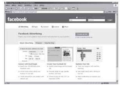
Can Facebook be sustainable in a long term?

Facebook sends results of the survey poll to those who paid for them (1.8). Application developers create services and applications which are used on Facebook platform (1.6). Facebook needs to give appropriate tools and the API to the developers (with documentation) (1.7). Microsoft is "supplying" Facebook with the advertisement banners (1.5). Advertisers using Microsoft banners need to create the content for them (1.9). Advertisers create the advertisements (graphics, text) which are placed on Facebook sites (1.4). Facebook can also supply advertisers with some information (1.3). "Facebook Insights" is the service of statistics about activity, demographics and performance of the ads. Users send content to Facebook platform in different ways: